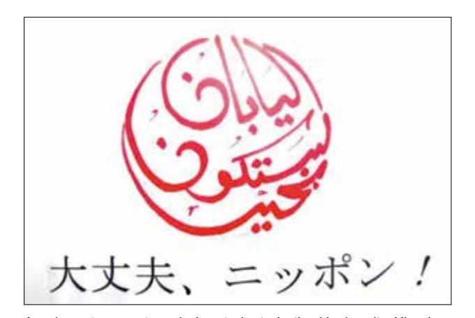
An elegant present made by students in the Hashemite Kingdom of Jordan (The red Archie characters made "His gains to be all right Japan!")

(The red Arabic characters mean "It's going to be all right, Japan!")