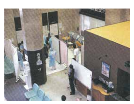
Triage at the hospital entrance