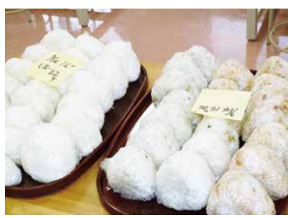
800-1,100 rice balls a day

There are 20 wards in the hospital and each ward had about 20 employees. We distributed five rice balls