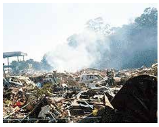
Damage from the tsunami in coastal lwaki City (March 12, 2011)

First, why were we physicians from Fukushima Medical University (FMU) caring for patients at medical facilities throughout the prefecture? Standing by at locales throughout the prefecture, had we anticipated this