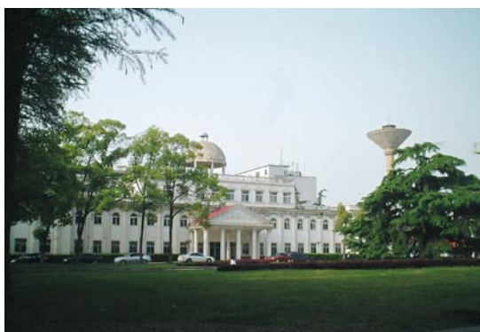
Student affairs office called "The White House in Wuhan"

The whole campus itself looked like a kind of large garden. There were tables and benches everywhere, which would be a good place for students to study, rest, have lunch and chat.