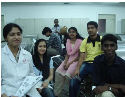
My friends in anatomical practice class

It doesn't always goes on this timetable. It'd change depending on the day of the week. Generally we have lunch break for about 2 hours. Students have lunch at the cafeterias, and after that they even can take a nap in their dorm. During this rest time, some teachers go back to their home to have lunch with their family. I envy them...I think this system is really reasonable. I'm positive that it can improve efficiency in their study or work.