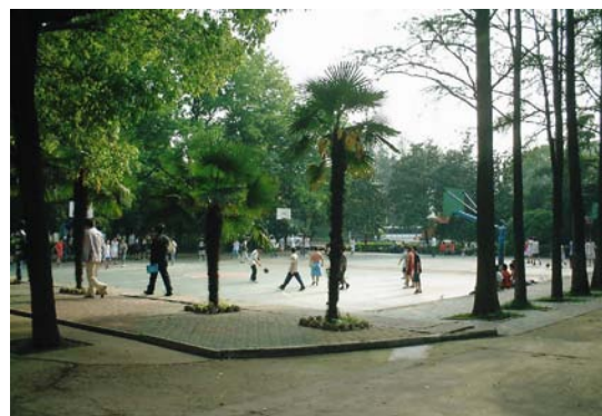
Everyone loves to play basketball