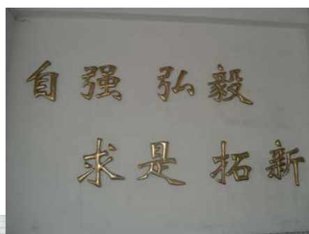
Fundamental principles of Wuhan University