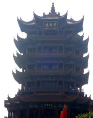
Yellow crane tower

In the Hubei Museum we can see many artifacts excavated from ancient tombs, a concert bell set etc.