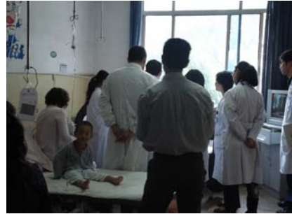
Patients' room at Pediatrics department

Wuhan university has 2 university hospitals. One is the 中南 hospital which lies next to the medical part of Wuhan university, and the other is a little far away. Some of the teachers in anatomic department showed me around the 中南 hospital. There are buildings for emergency medicine, internal medicine and for surgery. Each of the latter 2 has its own buildings for in-patients