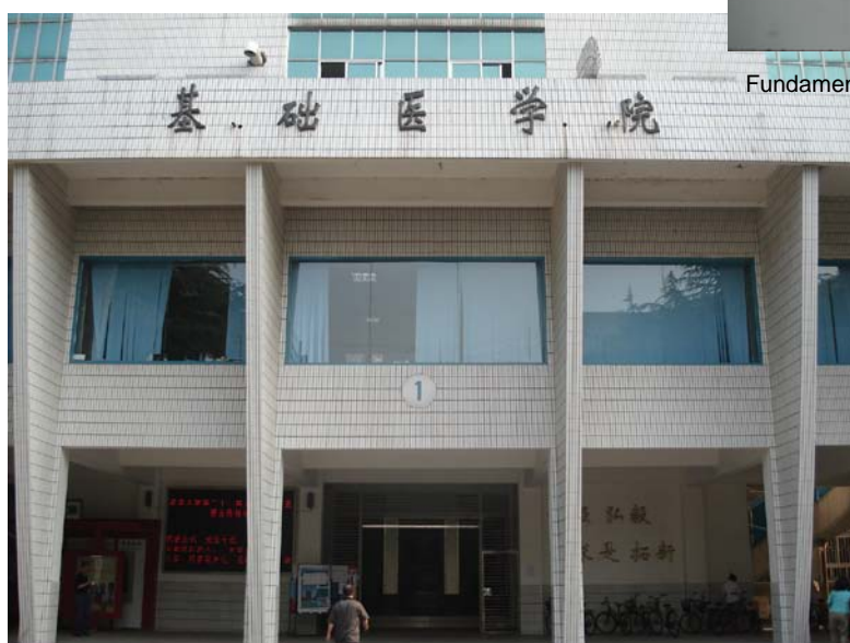
Basic medical science center