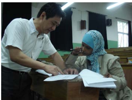
Ask some questions before class time

Teacher also pitches some questions to them during the class, then there comes to a free discussion, and then lastly teacher provides the answer. During the class, teacher checks many times to see if everyone understood or not. These things seem to reduce the distance between teacher and students, and that's why I felt more relaxed, friendlier atmosphere in the classes. I think we should learn from them in this respect.