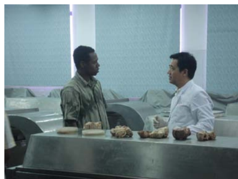
Asking some questions after class