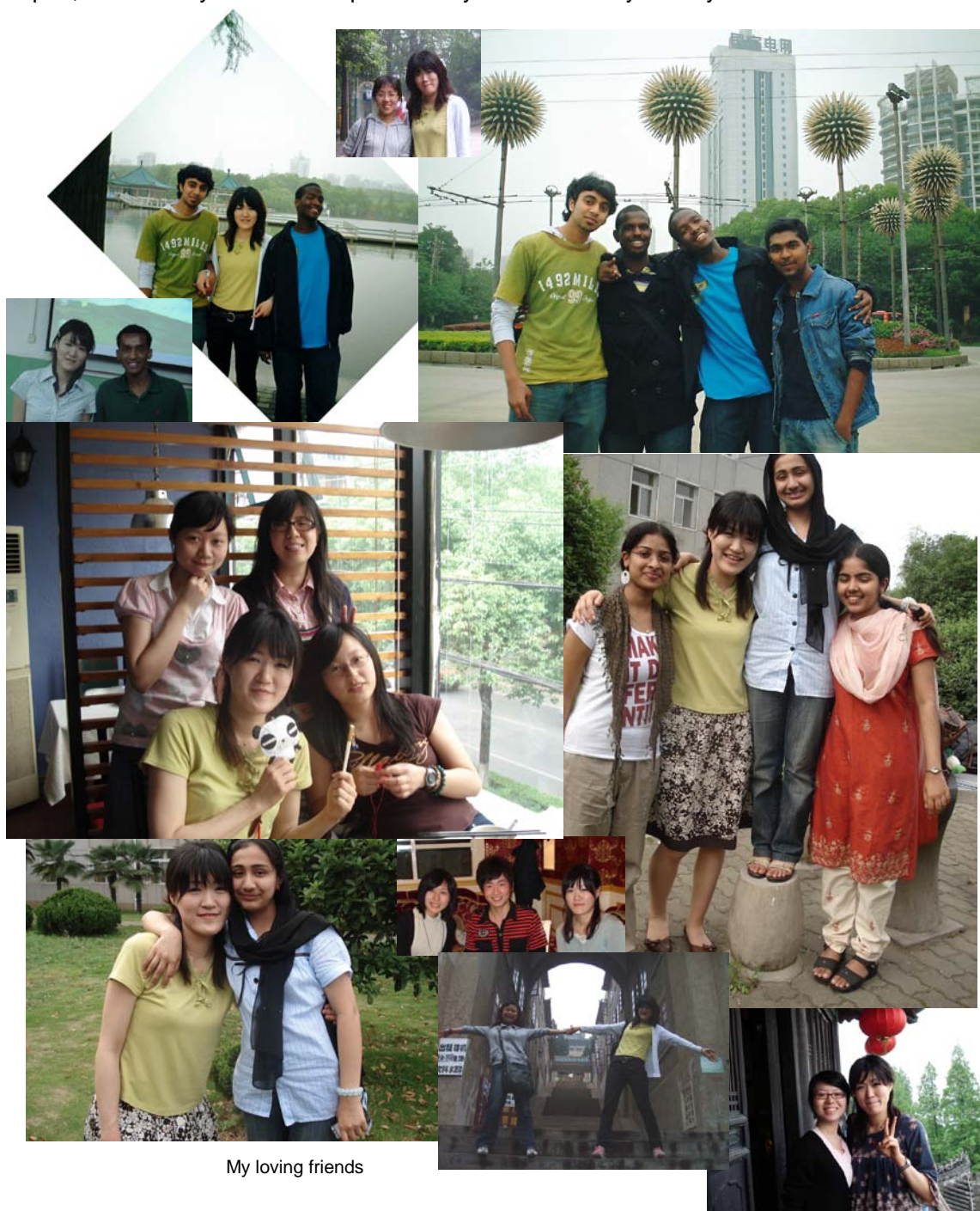
My loving friends

Friends: I met quite a lot of people there and made friends with them. I can't tell how I love them and it may be no exaggeration to say that the most valuable thing I've got during my stay in Wuhan is the friendship with them. We talked about lots of things, about our country, hometown, religion, family, friends, hobby, future...and even about our type of guy/girl! We spent time together in the classroom, in the corridor, in the campus, cafeteria...anywhere, anytime. I visited their dormitory and they also come over to my room many times and we had a nice time. Sometimes they took me out to have lunch, sometimes took me to beautiful spots nearby. We've been keeping in touch with each other by e-mail since I've returned to Japan, which really cheers me up these days. I'm sure they are my friends forever.