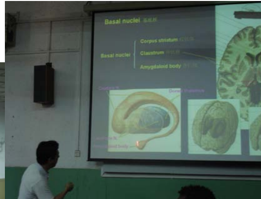
Systemic anatomy class

During the class, I noticed there were some differences between Fukushima and Wuhan. The biggest difference is about students. First I was so surprised and impressed with how active they got in their study. Everyone asks a lot of questions, trying to understand each item during the class time. Teacher explains about the matter as many times as need until they got the complete understanding.